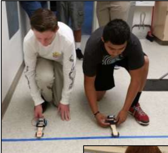
Students race their vehicles to test their designs.