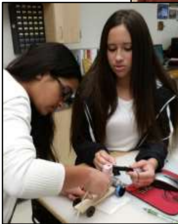
Learn physics, engineering, math and government applications.